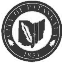
Exhibit A Ordinance 2015-4241